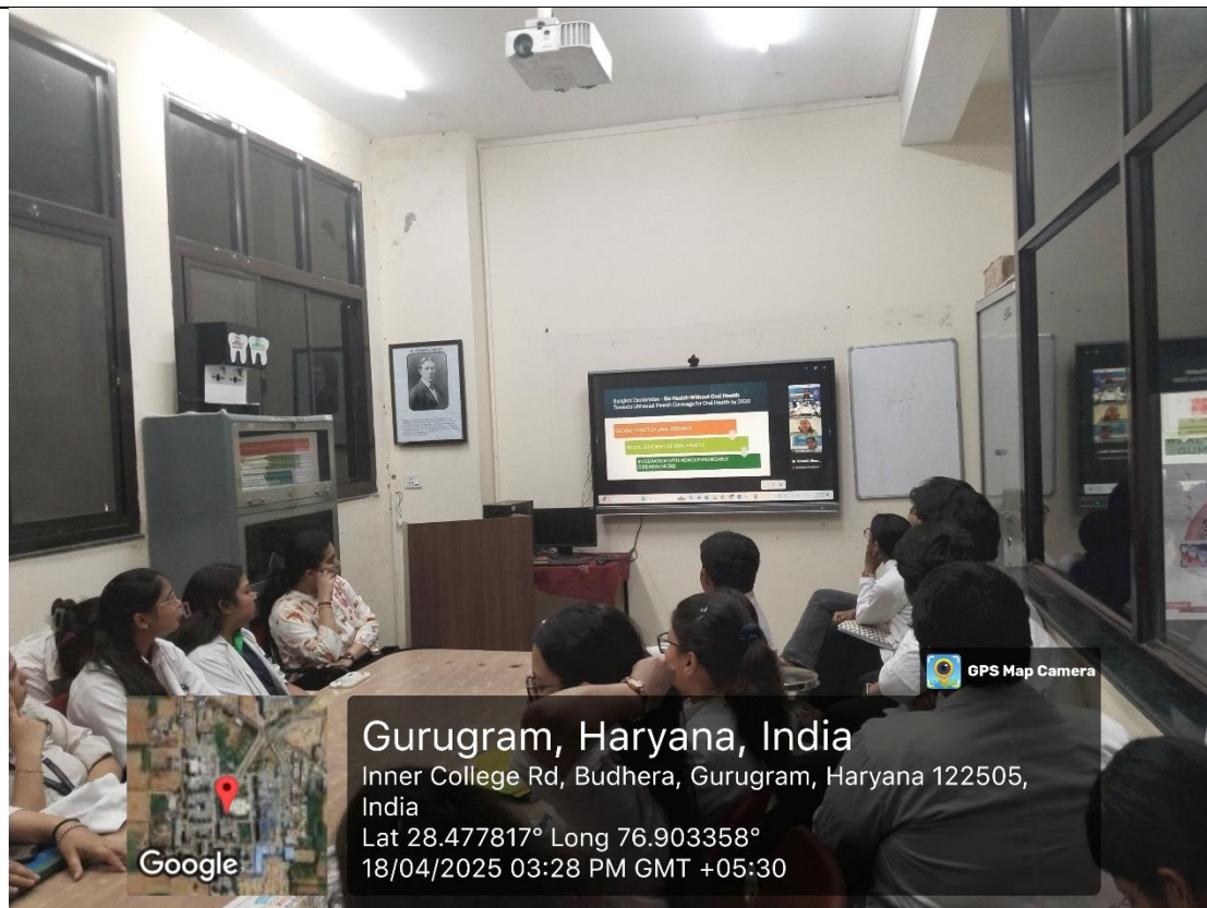
Students patiently listening to the webinar